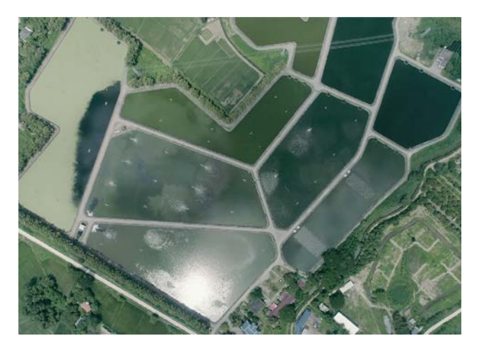
Aerated lagoons (AL) in Chiang Mai. This treatment method is typical for this region. ALs are easy and inexpensive to construct and operate. With this method, waste is degraded by various microbiological populations and pathogens can be effectively removed by aeration or exposure to sunlight.