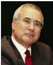
Nicholas Stern, Lord Stern of Brentford, Kt, FBA. Also IG Patel Professor of Economics & Government, London School of Economics.

Demonstration of effectiveness, efficiency and equity in a global agreement will encourage all countries to pursue their development aspirations via low carbon growth. New technologies can create great opportunities and provide impetus for new growth. Low carbon growth is the growth strategy; weak action will eventually stifle growth. The costs of action are a small price to pay for the grave risks they would avert. ♣