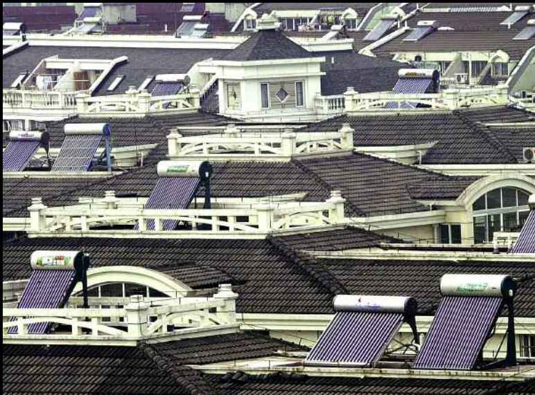
Solar energy water heaters are installed on the roof of apartment buildings in Ningbo, Zhejiang province, China.

THERE IS NOW A STRONG CONSENSUS EXPRESSED through the conclusions of the Intergovernmental Panel on Climate Change and other reports and the recent negotiations at the UN Climate Change Convention in Bali that the risks of inaction or delayed action on climate change are overwhelming; we possibly risk damages on a scale larger than the two world wars of the 20th century. The threat is particularly alarming for the world's poor people as inadequate responses to climate change would threaten progress on all the dimensions of the Millennium Development Goals.