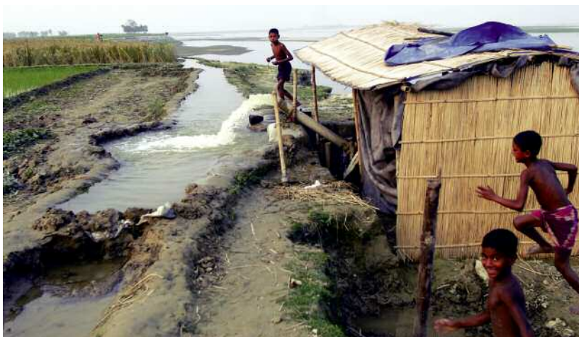
In the Bogra district of northwest Bangladesh, kids playing near the Jamuna River, which floods over during the monsoon season.

Third, equity is a concern we need to take to heart, as the starting point for taking action is deeply inequitable. Wealthy countries are responsible for the bulk of past emissions, while it is the poor countries that will be hit earliest and hardest by climate change. Fixed targets are crucial for managing risk and even a minimal view of equity demands that the rich countries' reductions should make up at least 80 percent of these global targets. Currently, the US emits more than 20 tonnes of carbon dioxide (CO 2 ) per capita per year, while Europe and Japan, with similar living standards, emit around 10 tonnes. China emits about five tonnes per capita, India around one and most of Africa much less than one. To reach a 50 percent reduction in global emissions by 2050, the world average per capita must drop from seven tonnes to two-three tonnes.