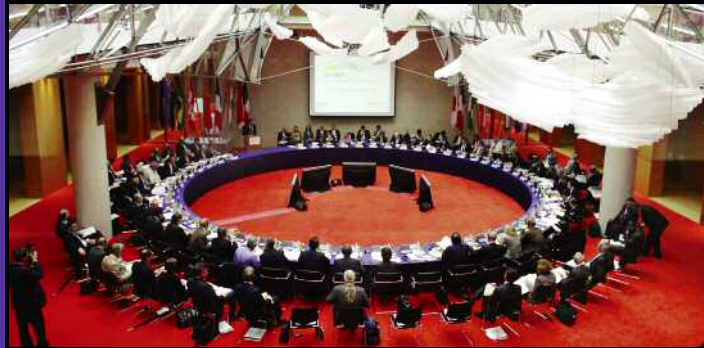
General view of the conference room during the meeting of the G8's Gleneagles Process on climate change and sustainable development held in September 2007 in Berlin.