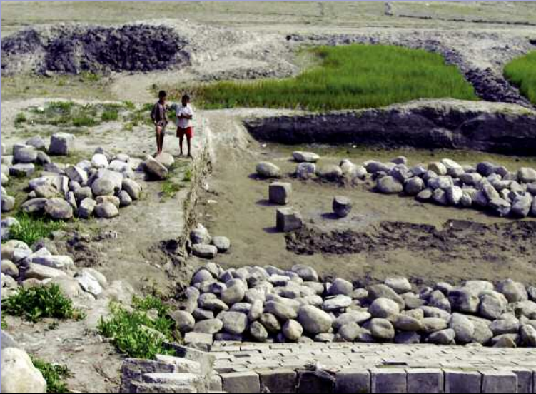
River bank protection activities along the Brahmaputra River, Bangladesh, that completely dries up during the dry season and floods over during the rainy season.

The problem of climate change involves a fundamental failure of markets, namely that those who cause damage by emitting greenhouse gases generally do not pay. This global problem requires a collaborative, global response. Leadership, acceptance of differentiated responsibilities, emission targets and trading must be at the heart of any future global agreement to reduce greenhouse gas emissions.